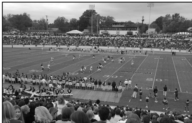
UR Stadium University of Richmond Richmond, Va. November 5, 2005