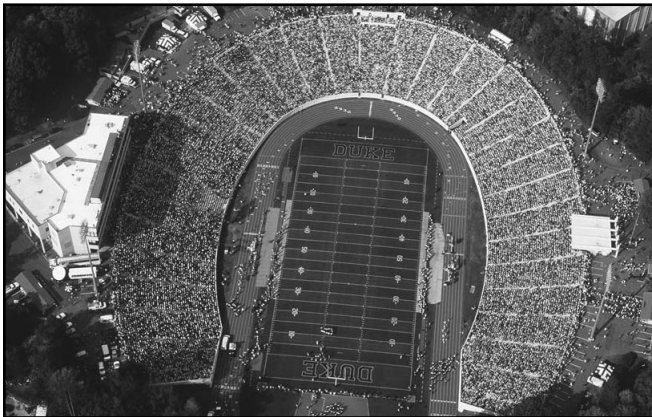
Wallace Wade Stadium Duke University Durham, N.C. September 17, 2005