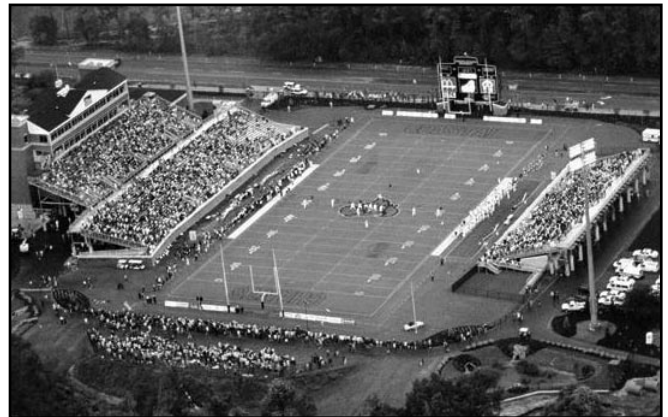
Brooks Stadium Coastal Carolina University Conway, S.C. October 29, 2005