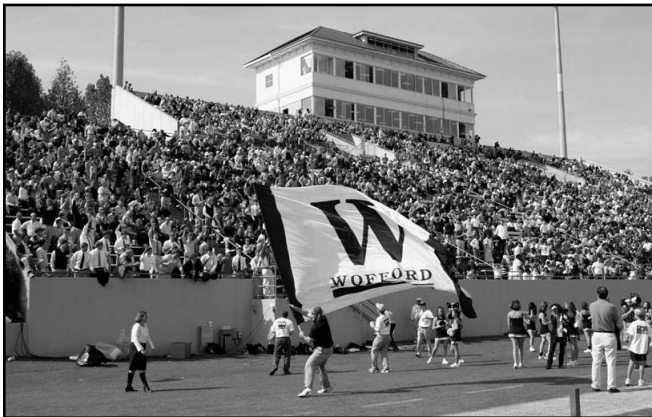
Gibbs Stadium Wofford College Spartanburg, S.C. October 15, 2005