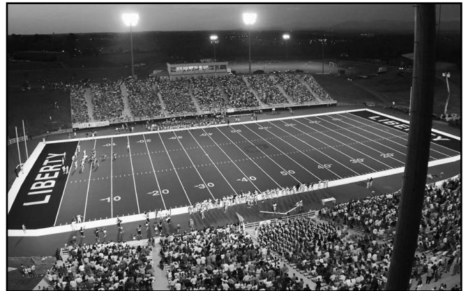
Williams Stadium Liberty University Lynchburg, Va. October 1, 2005